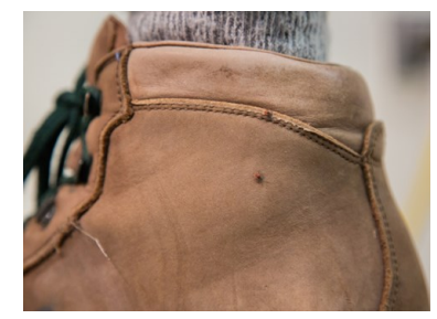
Ticks on a boot (CDC)